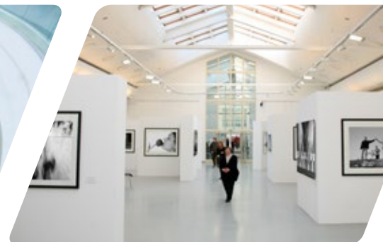
galleries and museums